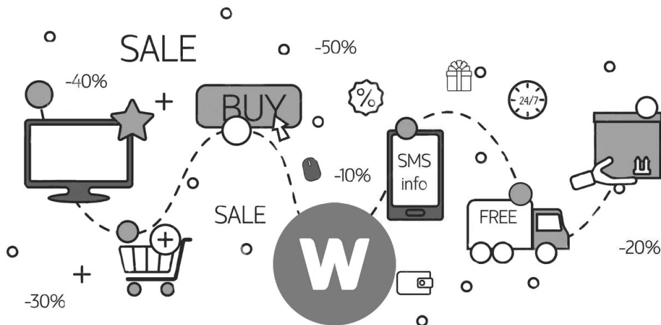
Figure 2: The Widecoin's benefits.

Both customers and merchants are increasingly using digital currency to make transactions, contributing to their growth and influence. In this burgeoning and relatively new marketplace, both sellers and buyers are recognizing the huge advantages that Widecoin offers. Listed below are a few of Widecoin's benefits: